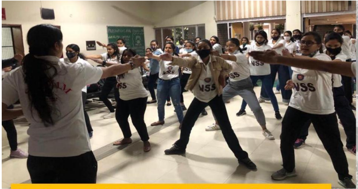
Session on Self Defense by Women Police Cell, Sector-17, Chandigarh