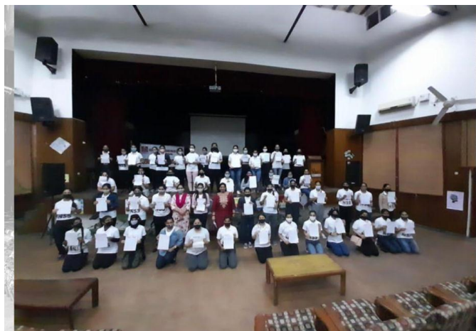
Essay Writing Competition on the theme 'Contribution of Freedom Fighters in India's Independence'