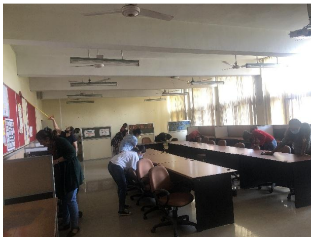
Glimpses of celebrations of Sadbhavana Diwas with pledge of unity